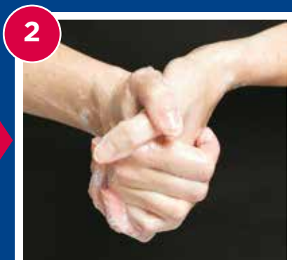
Soap up rubbing palm to palm