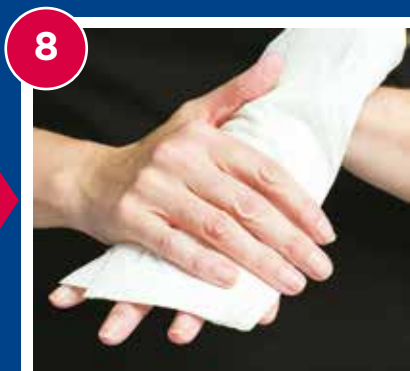
Dry palms and backs of hands using a paper towel to help remove remaining bacteria