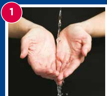
Wet hands and forearms