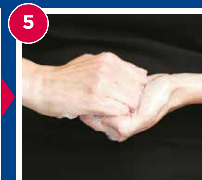
Scrub with fingers locked including finger tips