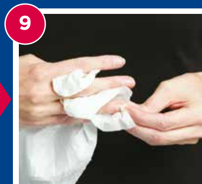
Work towel between fingers and dry around and under nails