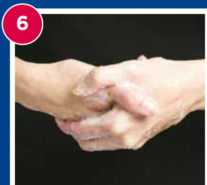
Rub rotationally with thumbs locked