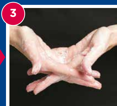
Rub with fingers interlaced