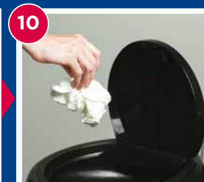
Place used towels in a bin, ensuring that you do not touch the bin lid with your hands